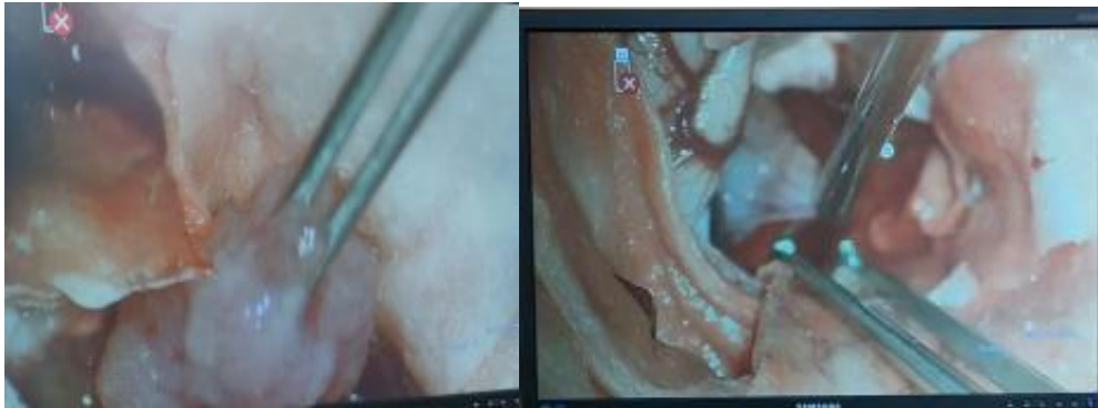
Figure 03 : Intraoperative images under the microscope showing the lesion.