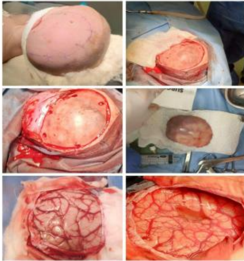
Figure 02 : Intraoperative images illustrating the various stages of the surgical approach.

The procedure was further aided by the utilization of an optical microscope as illustrated in (Figure 03) and intraoperative ultrasound guidance as depicted in (Figure 04) , ensuring precision and accuracy throughout the resection process (Figure 05) . Remarkably, the postoperative period was marked by an uneventful recovery trajectory, culminating in the patient's discharge on the 10th day post-surgery.