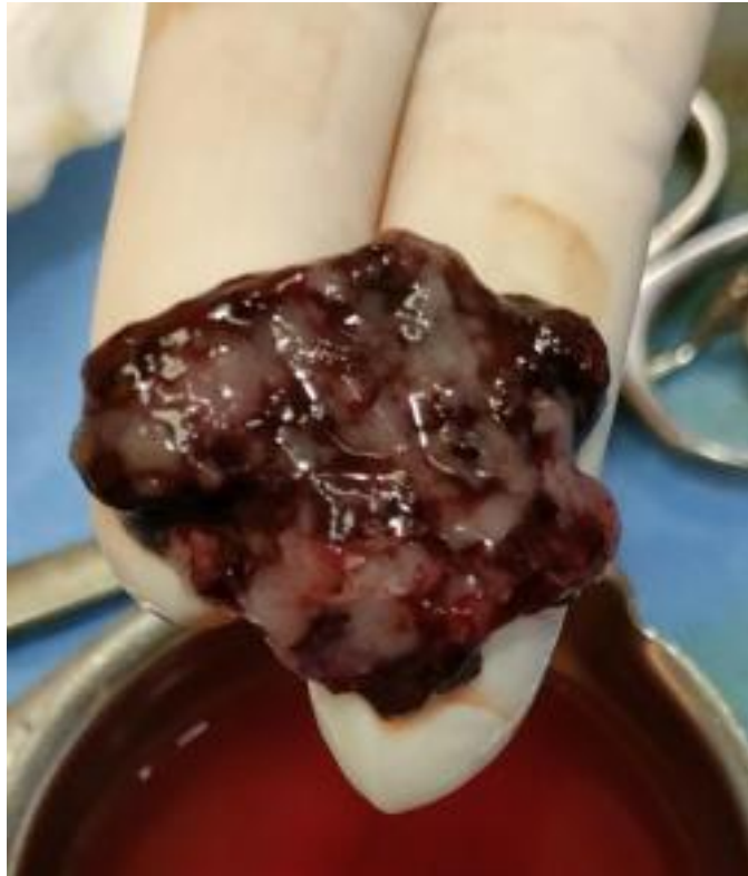
Figure 05 : Intraoperative image of the lesion.